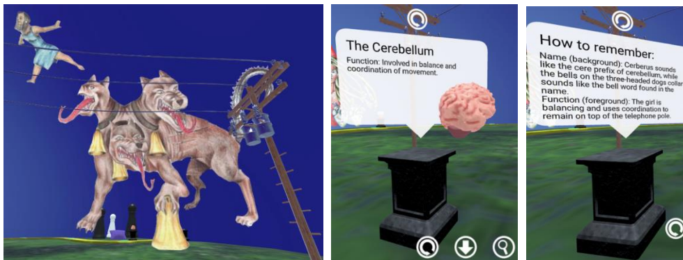
Figure 1. The girl in the foreground balancing on a telephone represents that the cerebellum oversees balance and coordination. The background is of the mythical Greek creature Cerberus with giant bells on its collar to help remember the name mnemonic of the brain part being Cere-bell-um. Desktop VR (DVR) and Headset VR (HVR) stimuli (left) with associated pedestal front (middle) and back (right)

Information about function is represented by having a pedestal for each scene that explains the mnemonic, as opposed to presenting the brain without learning aids. Each pedestal explains the name, function, their respective mnemonics, both in text and with a voice recording.