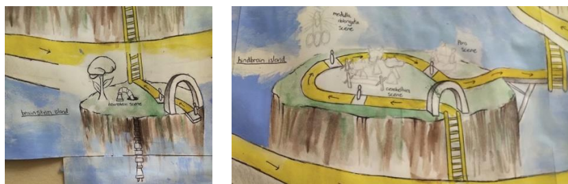
Figure 2. Overview sketch of the Brainstem Island (1 scene: The brainstem scene (left)) and of the Hindbrain Island (3 scenes: cerebellum, medulla oblongata, and the pons scenes (right))

The first island, representing the brainstem, has one scene: the brainstem (Figure 2). The second island, representing the hindbrain, contains three brain areas: the cerebellum, the medulla oblongata, and the pons (Figure 2). The third island consists of two sub-islands, visually represented as platforms (Figure 3). The first sub-island has 4 scenes: the tegmentum, the tectum, the red nucleus, and the periaqueductal grey. The second sub-island represents the basal ganglia's three brain parts: the basal ganglia scene itself, the striatum, and the globus pallidus. The last island is the forebrain area. It contains nine scenes separated again into two sub-islands (Figure 3). The first sub-island contains the insular cortex, the pituitary gland, the corpus callosum, and the olfactory bulb. The second sub-island of the forebrain represents the limbic system, and it had scenes for itself (the limbic system), the hypothalamus, the thalamus, the amygdala, and the cingulate cortex.